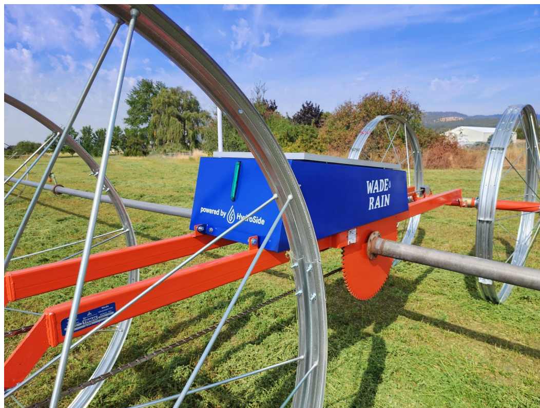
The above photo shows a wheel line mover powered by HydroSide.